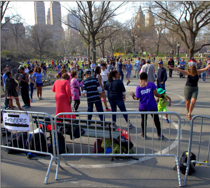
Dance Area at the Skate Circle