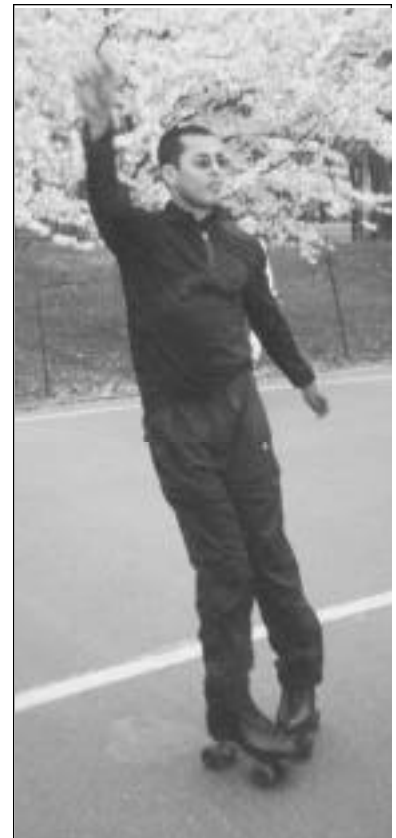
Getting into the groove.