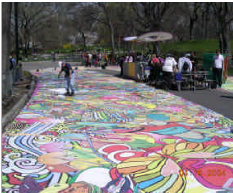
avaf's beautiful floorscape and redesigned DJ booth