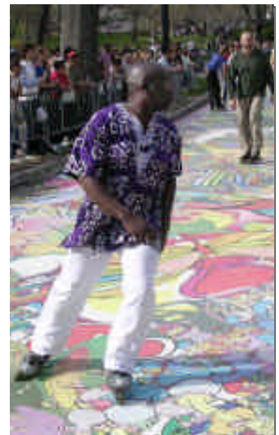
Skaters check out the colorful patterns below their feet

Also Available Man with a Van Pick-Up & Delivery Moving 24 hr. Service