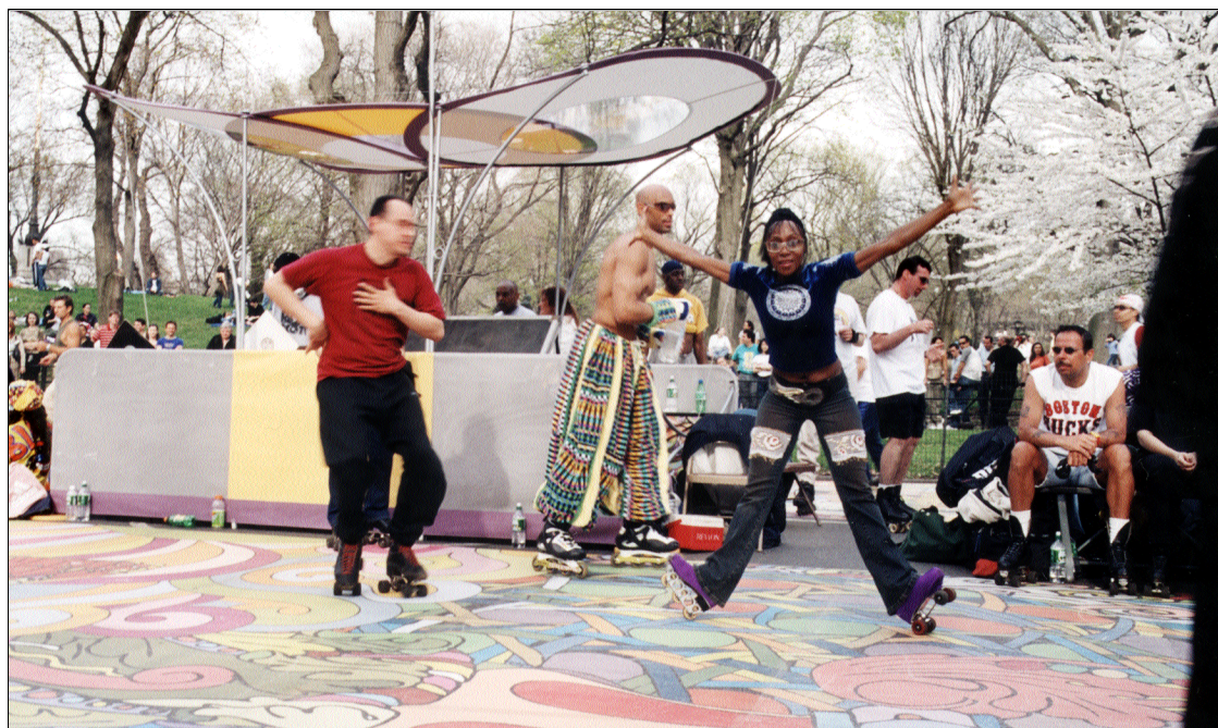
Skaters get into the groove on the floorscape at the CPDSA's 2004 opening day - April 16th

We fussed over it, patched it and pampered it for the three weeks of its life - loving it, awed by its beauty and truly perplexed to fathom why it could not remain. I do not grieve its passing, I rejoice that it was. It will live in my mind's eye for as long as I am on this mortal coil.