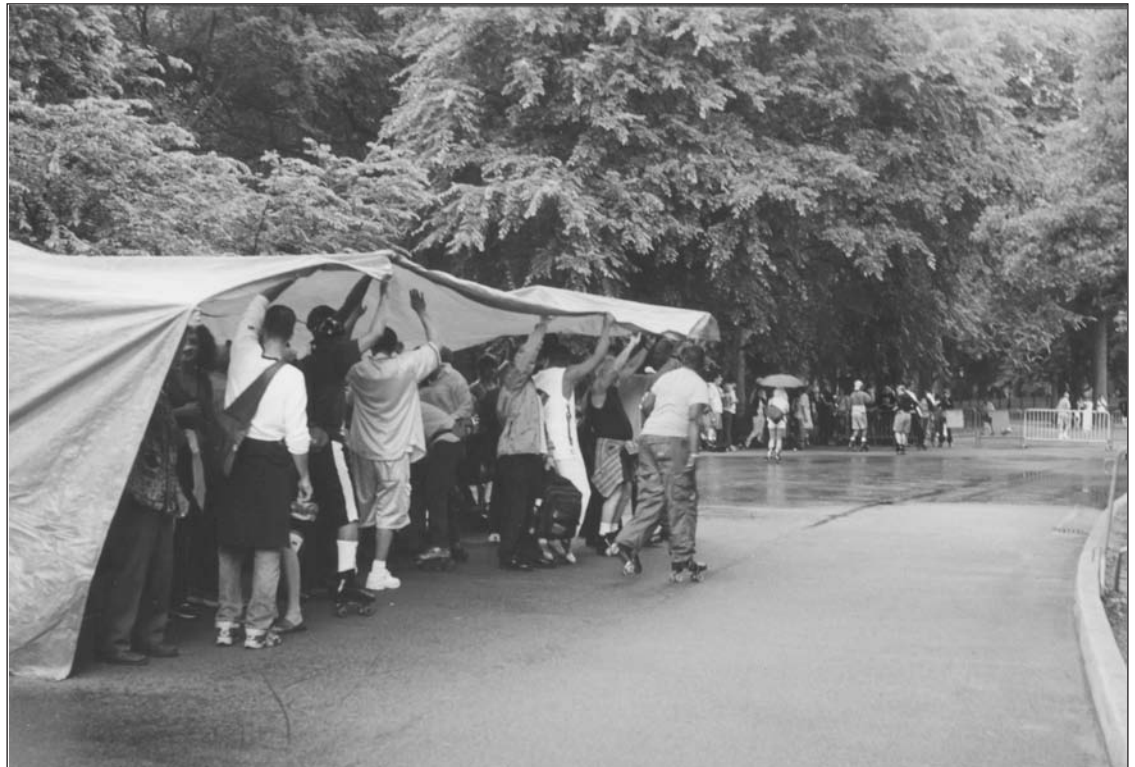
Rain, rain, go away, already!!!! An oft-repeated scene at the Skate Circle on weekends this season - die-hard CPDSA skaters hop over puddles and hold the big blue tarp overhead while the music plays.