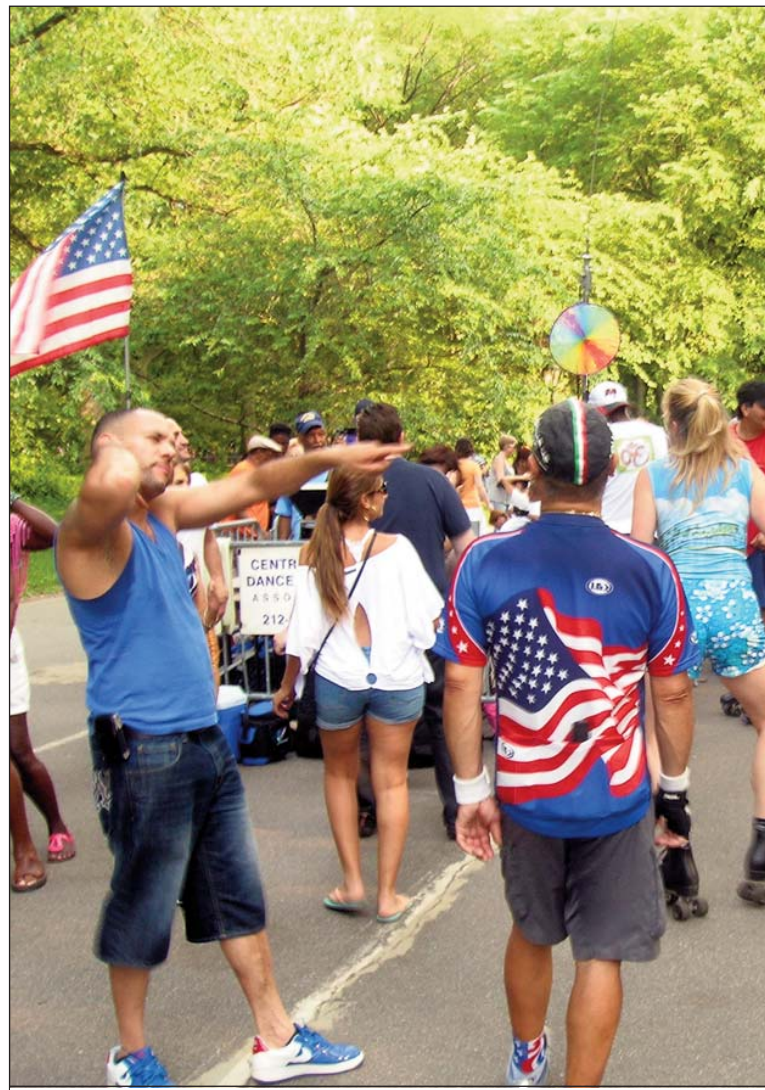
Good times at the Skate Circle on Memorial Day Weekend

(212) 777-3232 visit us on the web: www.SkateGuru.com