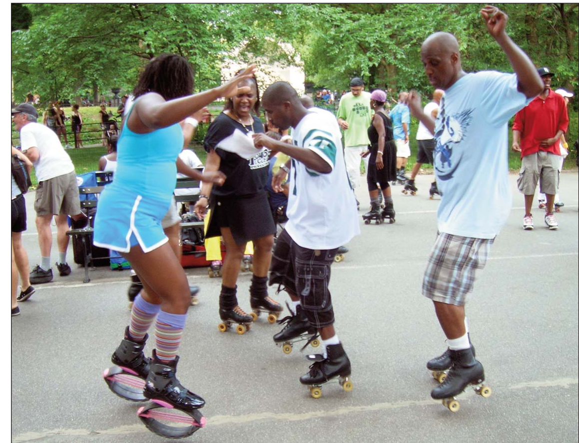
Hip hop and you don't stop...hoppers join the party in Skate Circle