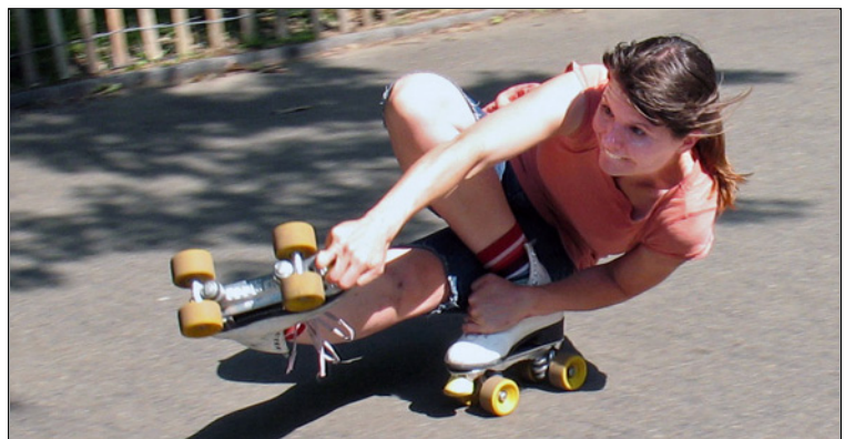
Check out these funky floor moves!