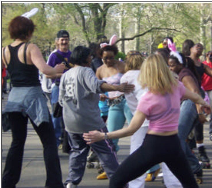
CPDSA Easter bunnies get their groove on