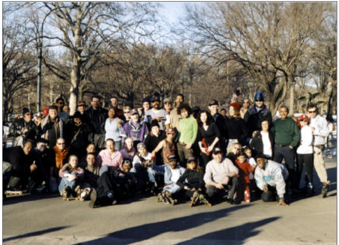
CPDSA winter skate crew in the house