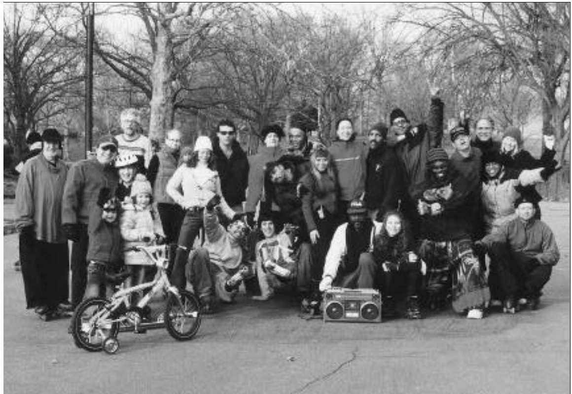
The winter skate crew had to be hardcore with this year's bitter cold temperatures - here they are, staying warm on a freezing Groundhog's Day in the park.