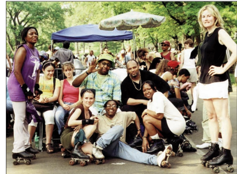
A happy group of CPDSA skaters taking a short break from the action to smile for the camera.

BLADIE FLOWNESS has created the world's first "INHOME INLINE SKATE LEARNING VIDEO." To check it out: http://www.thebladester.com