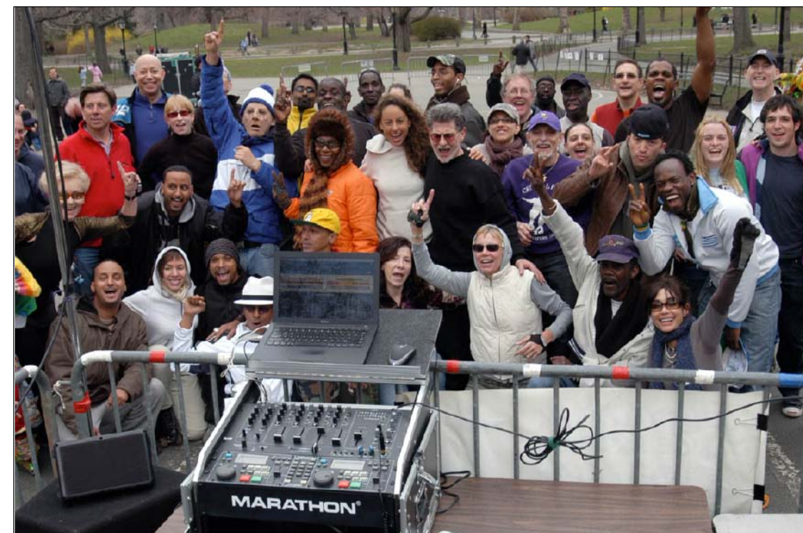
Opening day of the CPDSA 2008 season!