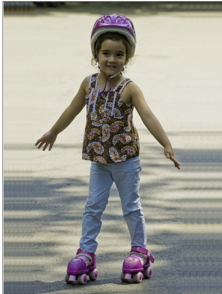
Future CPDSA superstar