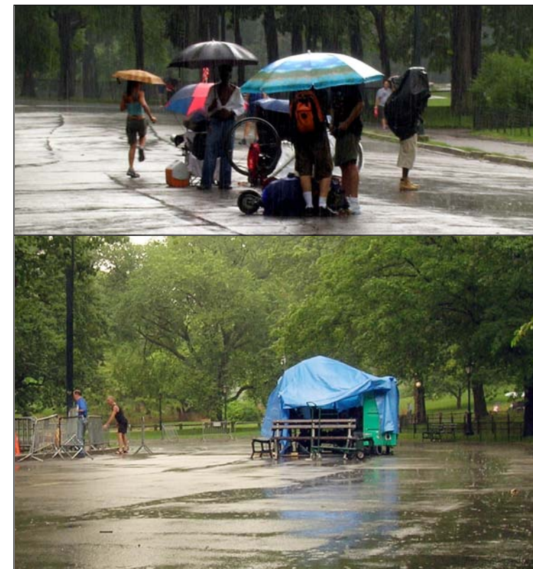
Skaters await the passing of another summer shower