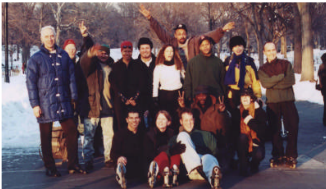
The CPDSA's diehard skate crew basks in the warmth of an unusually sunny day in the middle of winter.