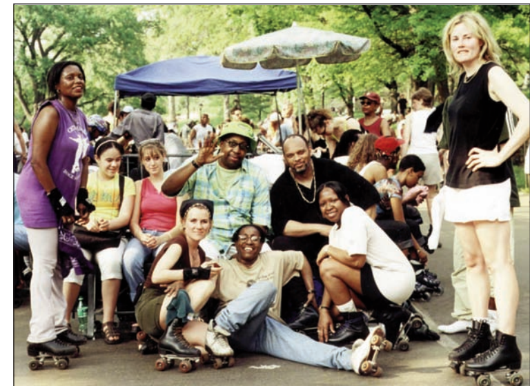
A happy group of CPDSA skaters taking a short break from the action to smile for the camera.